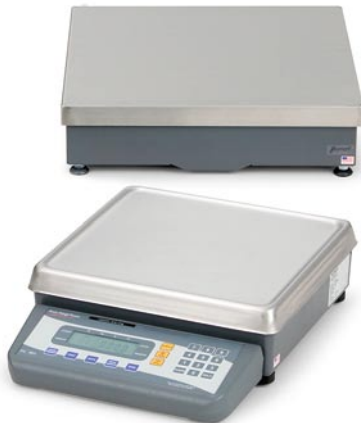
PC-905 with optional remote base.

Lets operators enter and recall known piece weights and tare weights.