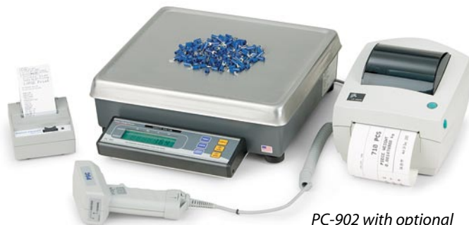
PC-902 with optional barcode gun and printers.