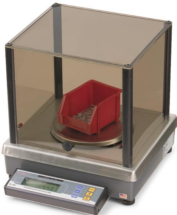
PC-902 with draft shield.

Maintaining quality control is also critical. Companies want to give their customers exactly what they paid for. Time and again, shipping less than ordered leads to dissatisfaction and lost customers. Accuracy translates to freeing up of capital and satisfied customers.