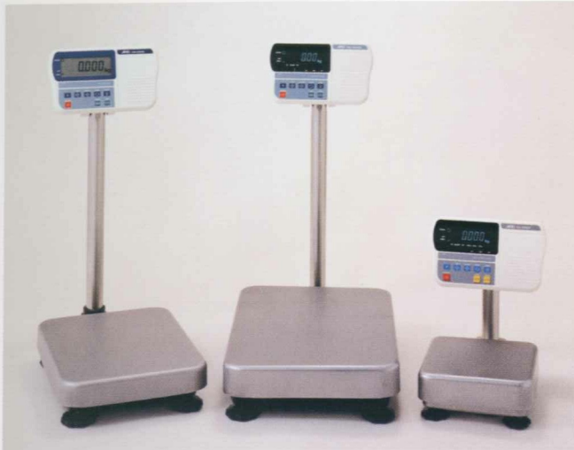
▲ Popular Standard Medium Type