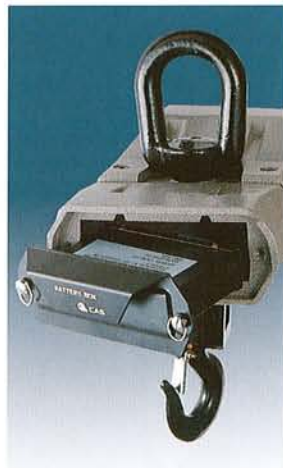
▶ Battery Pack Installation