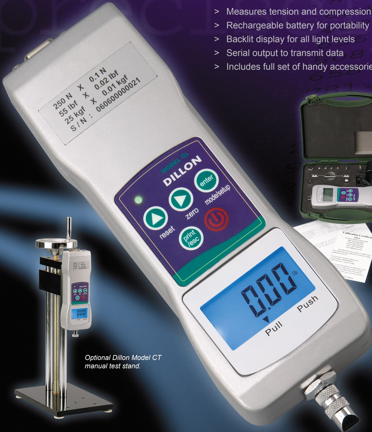
Optional Dillon Model CT manual test stand.