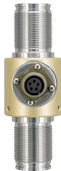
SGMT Designed for overhead suspension. Optional eye nut available.