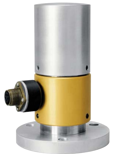
SGMC Includes cap and base.

See back page & Dillon Load Cells specifications sheet for more dimensions and detail