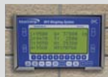
Optional Wall Mount for Indicator