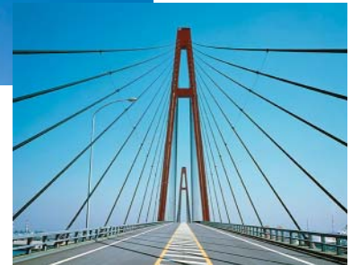
Bridge Guy Lines