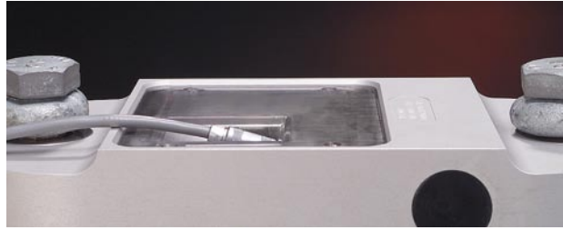
Small details improve durability. The EDxtreme features a recessed connector and embedded antenna to help prevent damage from snags that commonly disable other instruments.

Specifications and dimensional details are available from an authorized Dillon Distributor or the website at www.dillon-force.com .