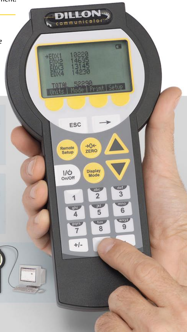
Optional Remote Communicator

A basic stand-alone model can be easily upgraded "in-the-field" to accommodate changing needs. Remote configuration, data acquisition and single point monitoring of multiple links are all possible with the hardwired or radio communication options available with the EDxtreme.