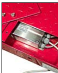
Top-access to pre-wired junction box