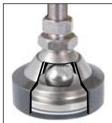
Precision ball and cup feet minimize side load shocks