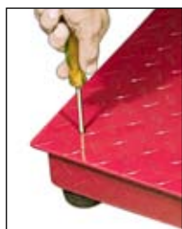
Top-access leveling adjustment