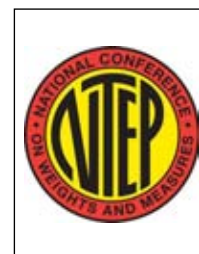
NTEP approved COC# 93-074